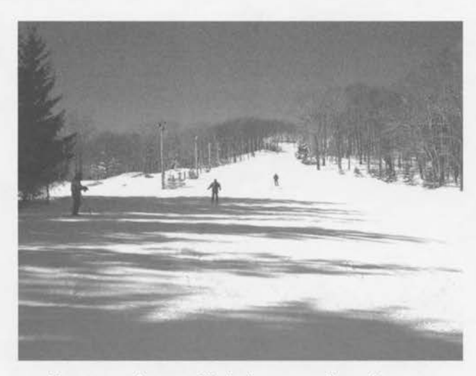
It was a beautiful day on the slopes.