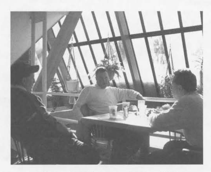
Discussing the morning's skiing.

We had a great time and are looking forward to the Fourth Annual Snow Meeting next year. We hope more people can make it. Remember, you don't need to ski to come up and have a good time.