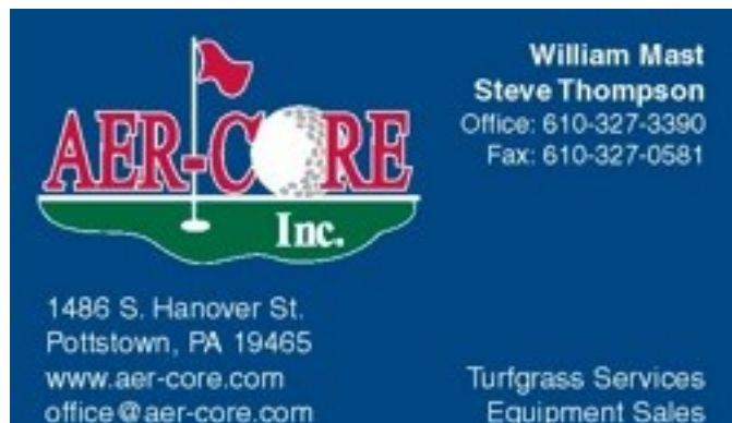
Photo of the Month

We all see interesting things every day....wildlife (like bald eagles and bears), strange turf problems (like a lightning strike), an employee who stayed out too late the night before, etc. So if you have a great photo, send it to me (bbachman@genesisturfgrassinc.com) and share it for everyone to enjoy (or laugh at).