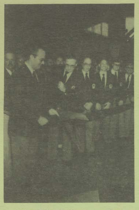
The Equipment Show Ribbon Cutting Ceremonies opened the way for vendors to display many new products.