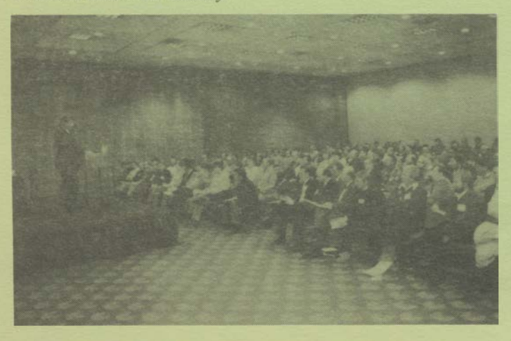
Lecture Rooms were filled to the max with intent listeners taking home more knowledge.