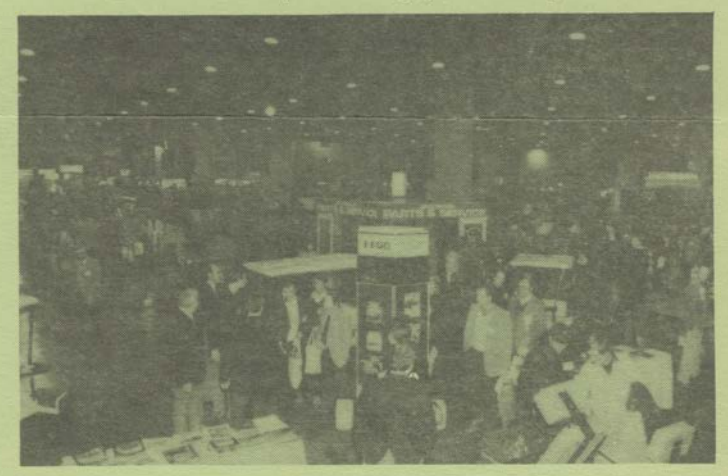
Equipment Trade Floor was constantly crowded with Supts. eyeing something new to take back home.