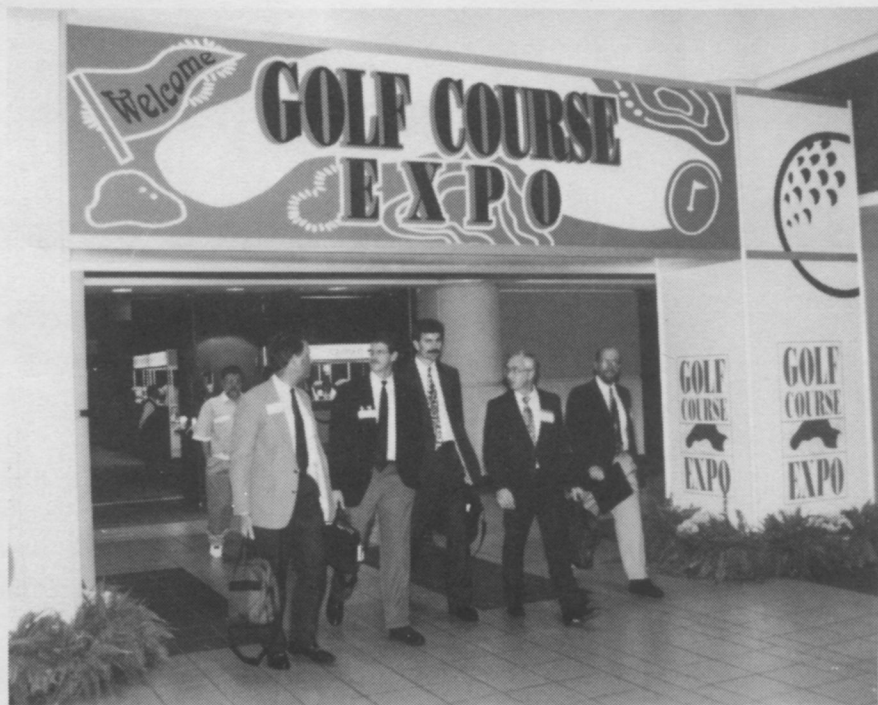
The staff of The Golf Course News compare notes at the end of the first day of the Golf Course Expo held in Orlando

It seems as though all of our calendars are filling up with meetings, educational conferences and seminars, fund raising tournaments, and trade shows. Only you can decide which will fit your schedule, budget, and professional and personal growth needs. The Golf Course Expo is now another item on the menu. They'll be back next year on November 9th and 10th.