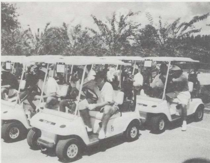
Lake City Alumni and friends line up for the start of the 1996 LCCC GLO Alumni Golf Tournament