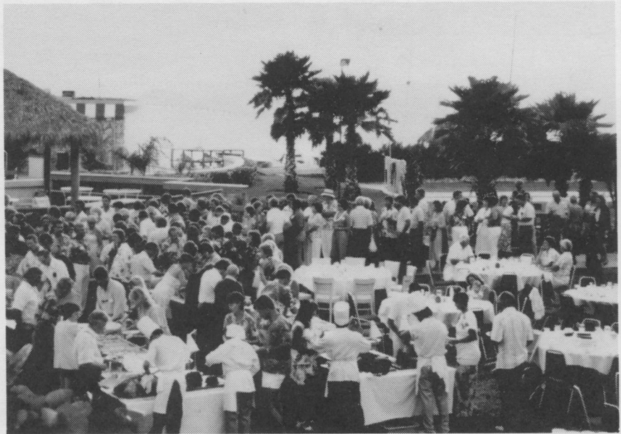
The last luau at the Naples Beach Club was a great event. Don't miss out on the good food this year on FRIDAY , May 15th.

The weekend concludes with the G. C. Horn Tournament at the Nles Beach Hotel GC on Sunday morning at 8:00 a.m. The format will be adjusted due to construction. Over six holes, two-man teams will battle each other to win two holes outright. If neither team has won in six holes, there will be a shoot-out of either putting or chipping to determine the winner.