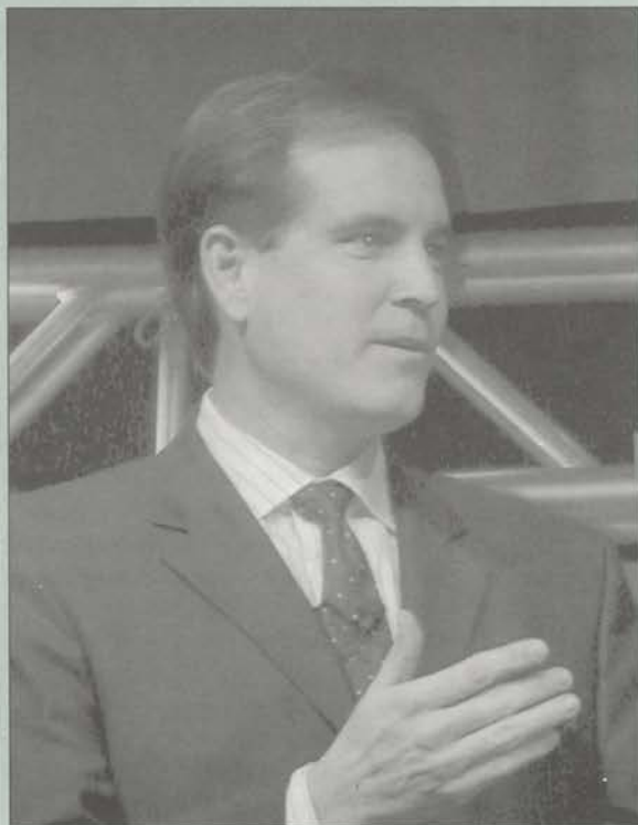
GCSAA Keynote Speaker, Jim Nantz, had the crowd buzzing when he pledged to do a better job of publicizing the role of golf course maintenance in the game.