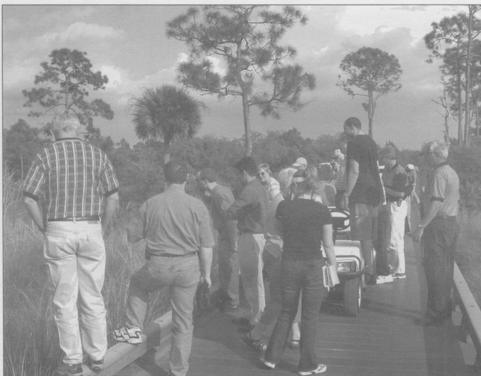
Federal, Regional and State Regulators get a photo op of an 8 foot gator on the Spring Regulatory Tour on the Old Collier G.C.