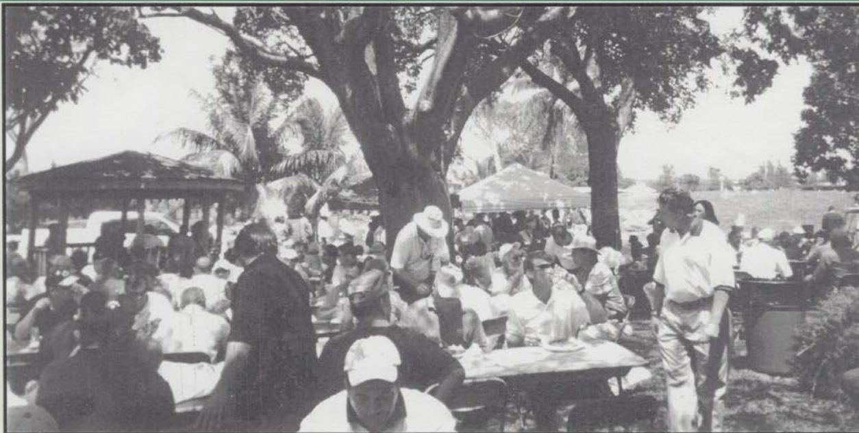
A storm took out the lunch tent so it was open air dining for the 500 attendees of the South Florida GCSA 2005 Turf Exposition and Field Day in Fort Lauderdale. See story on page 5 of this newsletter.

NEWSLETTER OF THE FLORIDA GOLF COURSE SUPERINTENDENTS ASSOCIATION