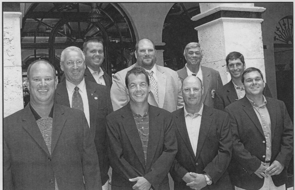
FGCSA Directors for 2005 - 2006

Since there was no further business, the meeting was adjourned at 1:30 p.m. so that the 2005 Annual Meeting and Election of Officers could begin.