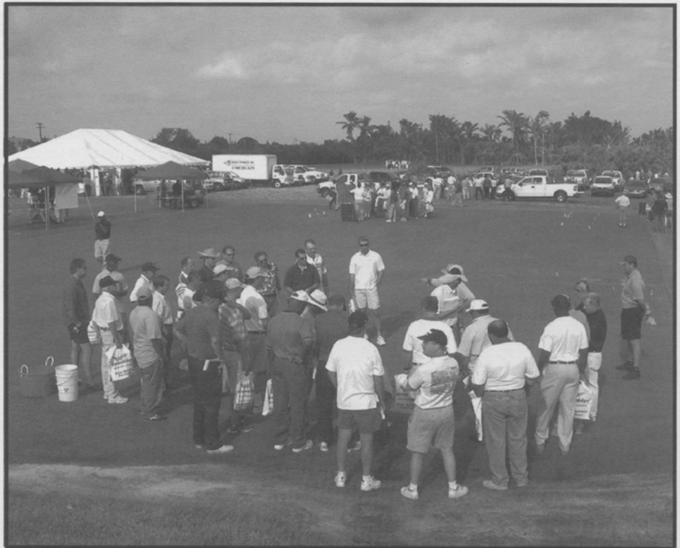
Superintendents check out results on ultradwarf bermuda research plots during turf tour portion of the Turf Expo.