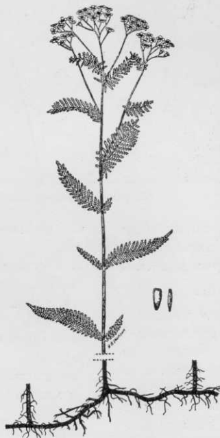
YARROW, in full bloom

of ours in Germany say that Yarrow is not cultivated there but that the seed is hand collected where it grows wild. "It is used for sheep pastures and also in chemists' shops as a medical drug."