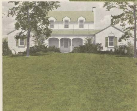
Before and after. This lawn, treated just as the trees were beginning to leaf, was clear of dandelions by the time the trees were in full glory.

to the lawn. This procedure was originally suggested by scientists in the U. S. Department of Agriculture about five years ago.