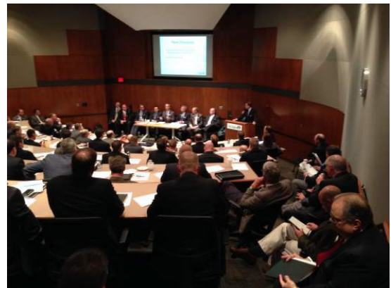
Chapter Delegates, GCSAA Staff and GCSAA Board Members discussing various issues at the Chapter Delegates Meeting.

The GCSAA Chapter Delegates Meeting was held October 14-16, 2014 at GCSAA Headquarters in Lawrence, KS. There were many subjects presented and discussed and action was taken to move the Association and its Members forward. In addition, all candidates for office made presentations and were interviewed by the delegates. Delegates representing 87 Chapters were present and those I spoke with thought it was an informative and productive session. Membership classifications, inclusion of equipment managers, a dues increase, size of the board of directors and other items were discussed. Details of the outcomes of the subjects considered will be available soon.