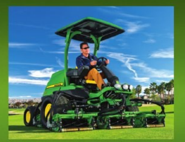
Our new A-Model PrecisionCut and E-Cut Hybrid Fairway Mowers give you more control and better results, thanks to our revolutionary TechControl display.