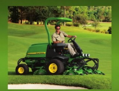
Our rough, trim and surrounds mowers greatly increase efficiency and trimming capability. From reels to rotary decks, we have you covered in the rough and surrounds.