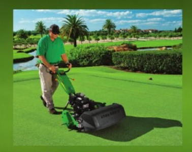
Some of the lightest mowers in their class, our SL PrecisionCut<sup>™</sup> and E-Cut Hybrid walk-behinds allow effortless turning and better engagement with the turf.