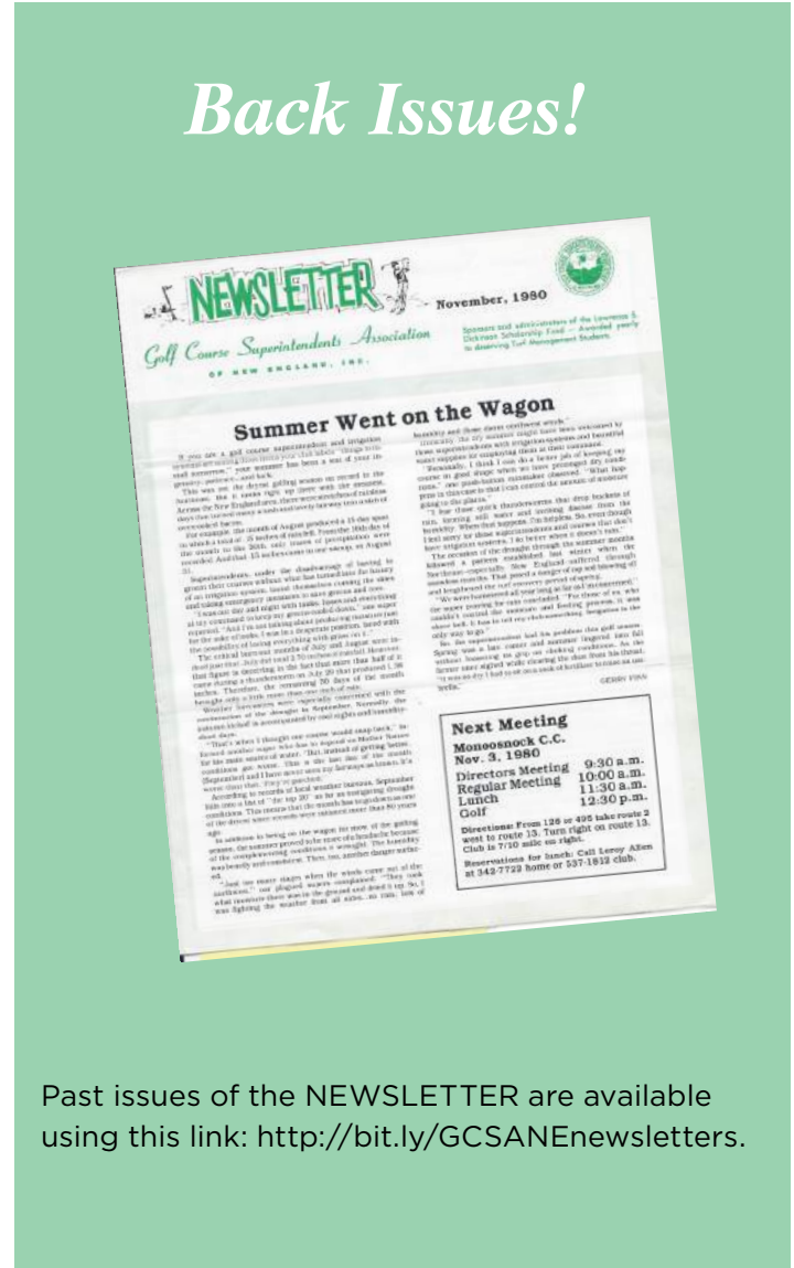
Past issues of the NEWSLETTER are available using this link: http://bit.ly/GCSANENewsletters .