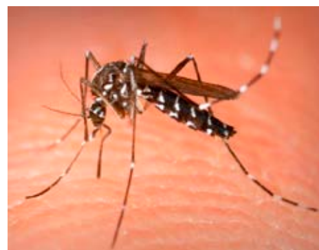
Mosquitoes, like Aedes aegypti, are responsible for the spread of dangerous diseases, but there are many sustainable and effective ways to prevent their impact throughout the summer.

management plan An Integrated Mosquito Management (IMM) program uses science, technology and environmentally responsible applications to target the