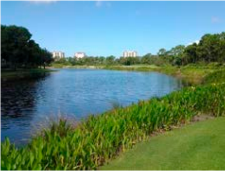
Beneficial buffers and native plants can help attract dragonflies, which are a natural predator to mosquitoes.

simple, natural and effective ways to limit and prevent their impact on your outdoor activities. Now that the days are getting longer and warmer, take some time to prepare for a mosquito problem before mid-summer hits—your bare skin will thank you.