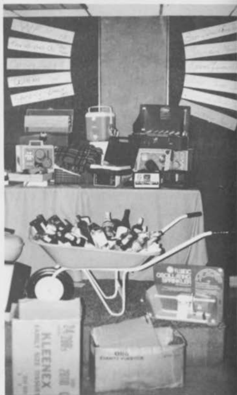
One of the big prizes — a wheelbarrow full of booze.

It was also pointed out in the report that 45 percent of our total membership did not participate in anyway in this endeavor. In other words, only 55% of our membership cares about our future.