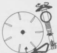
SINGLE KNOB, BEDKNIFE-TO-REEL ADJUSTMENT

Roughmasters, for rough mowing (with 4 or 5-blade reels?)