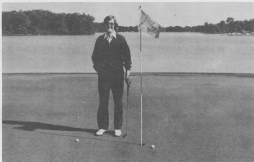
Winner of Closest to Hole on number 16.