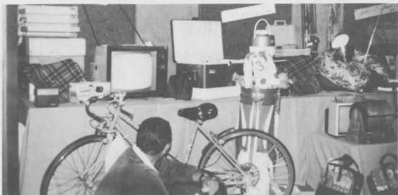
Some of the prizes given away at the Golf Day Benefit at Bay Pointe Golf Club in September.