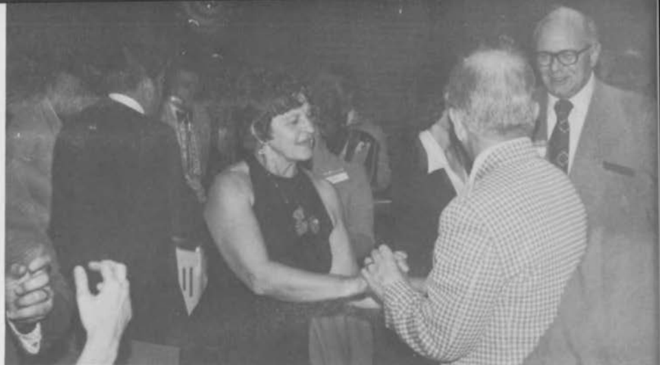
Some of the dancers enjoying the music at Edgewood.