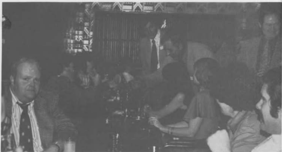
The "crowd" enjoying a break in the dancing.