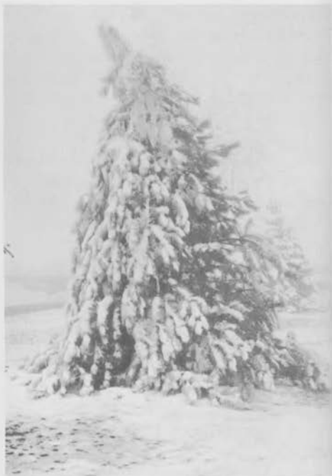
A limber spruce that made it without damage.