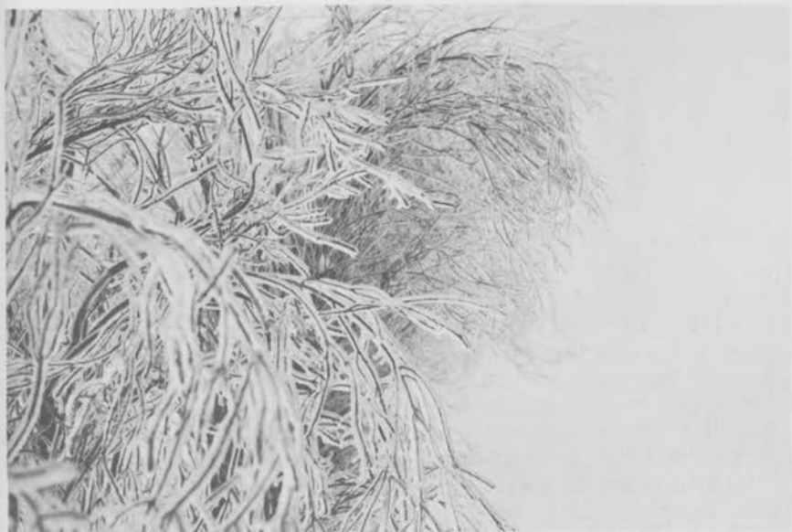
▲ A closer look at the ice accumulation. ▼ There was some beauty despite all the damage.