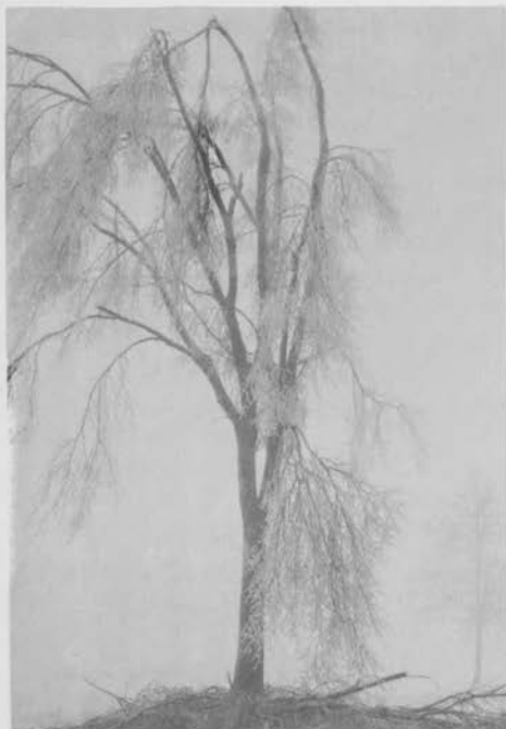
Ice damage to trees in southeastern Michigan.

It will be several years before some of the trees will display their old shapes and beauty.