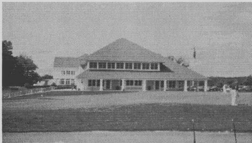
Egypt Valley Country Club, Sight of the 1993 Golf Day