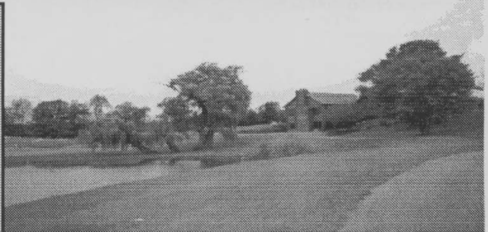
Thornapple Creek, Sight of the 1993 Annual Meeting.