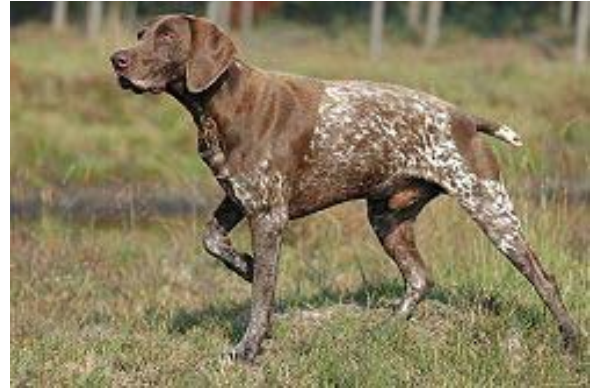
German Shorthaired Pointer, Max, Joins Saucon Valley Country Club Just in Time for 2009 U.S. Women's Open!

At 5 AM each morning, Max rushes through breakfast to wait anxiously at the door for the 6 AM start to his workday. He loves his new home and new job.