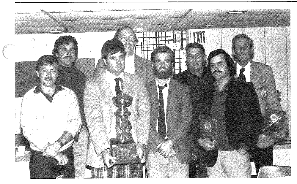
Some of 1984 Golf Winners in CAGCS Championships