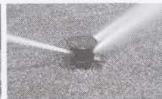
Authorized Hunter Golf Distributor