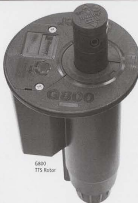
G800 TTS Rotor

Golf Hdqtrs: Milford, 110 Raton Dr., 877-878-0658