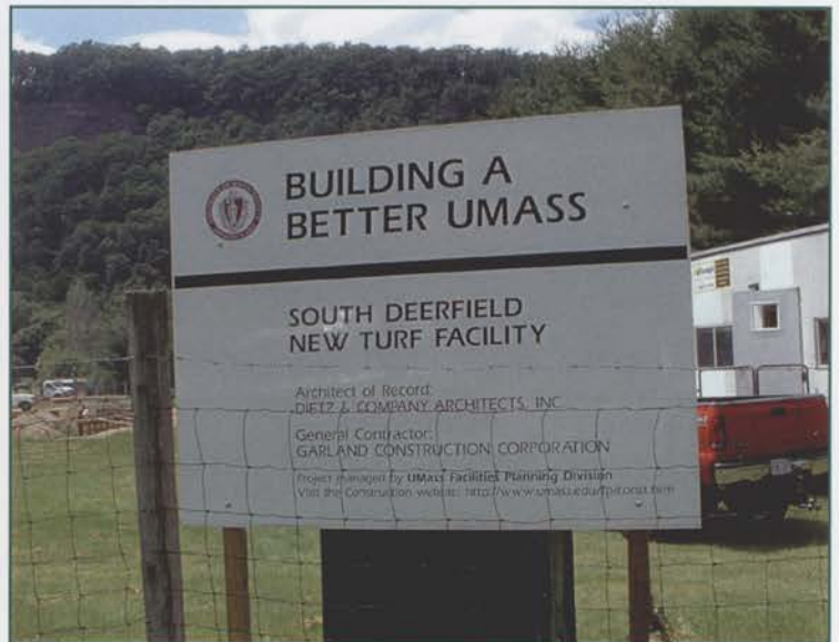
June 22, 2005 Construction of new turf building at Joe Troll Research Center has begun.