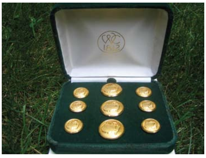
We have all seen the presentation of the Green Jacket following the Masters Tournament. These are the brass buttons that are attached to it. They were made right here in Connecticut in Waterbury, by Waterbury Company.