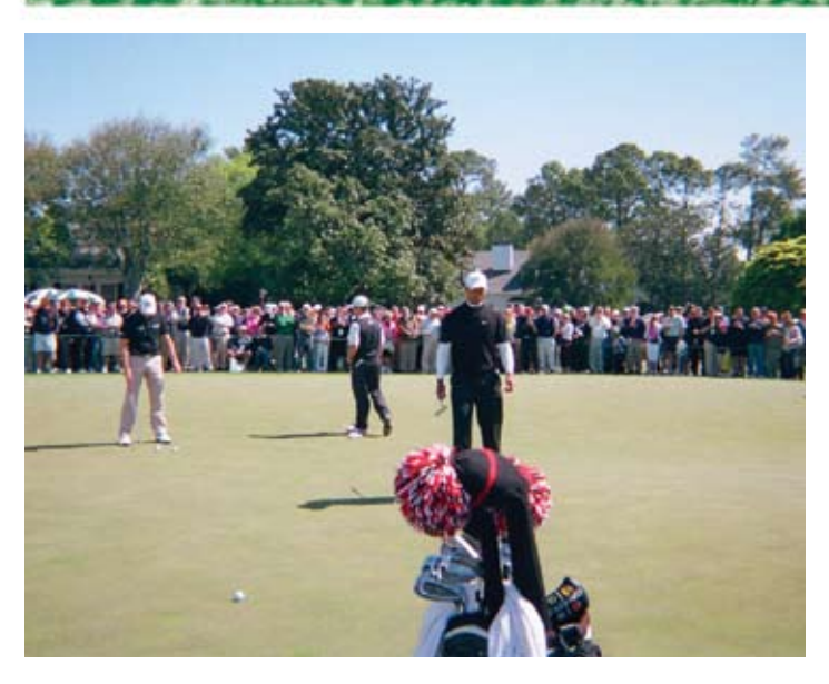
"Yes, that's Tiger walking over to ask us for putting advice."