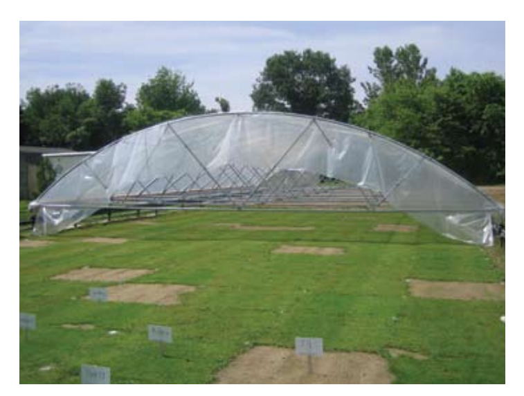
UMASS Drought Resistant Turf Study. This cover will automaticaly cover the turf when it starts to rain.