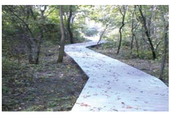
Green bridge for environmental areas on golf courses.

Golf's recent commitment to all things green bodes well for these new alternatives.