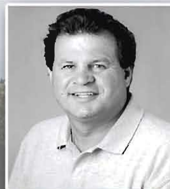
Keynote Speaker Tues., March 8 • 3:45pm Olympic Gold Medalist Mike Eruzione

Monday, March 7 • 8am-5pm Call (401) 841-5490 8am-12pm Back to Basics: Strategies for Managing Turf in Extreme Years 8am-12pm Basic Excel Training for Turf Managers 8am-12pm Water Conservation and Energy Efficiency Management for Golf Irrigation Systems 1pm-5pm Maximizing Disease Control with Modern Fungicides 1pm-5pm Advanced Excel Training for Turf Managers 1pm-5pm Got Water? Water Conservation Issues in Turf 1pm-5pm CPR/AED Training