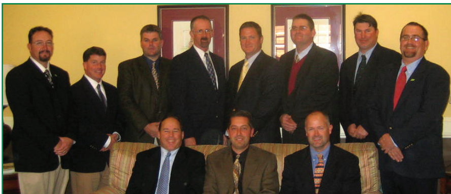
2010 Board of Directors

CONNECTICUT ASSOCIATION OF GOLF COURSE SUPERINTENDENTS