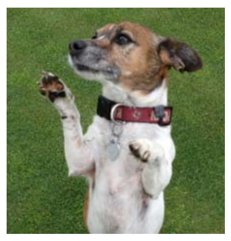
"Looking forward to seeing you at the UCONN Filed Day on July 15th." – Gordie