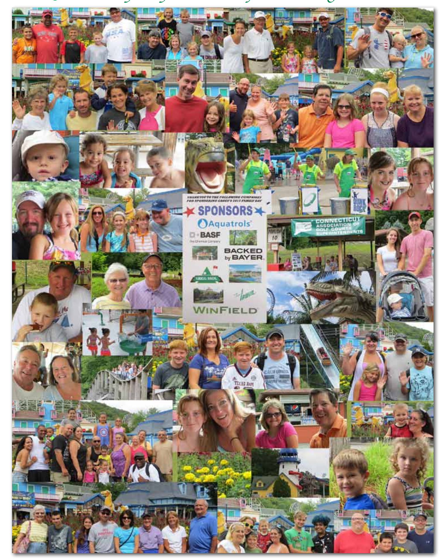
CAGCS Family Day - Lake Compounce - August 23, 2015