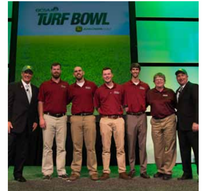
Congratulations to UMASS on finishing 10th place at the 2016 GCSSAA Turf Bowl