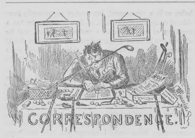
THE PROPOSED SOCIAL GOLF CLUB.