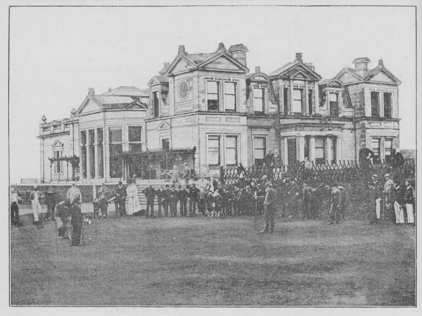
"THE HOME HOLE," ST. ANDREWS