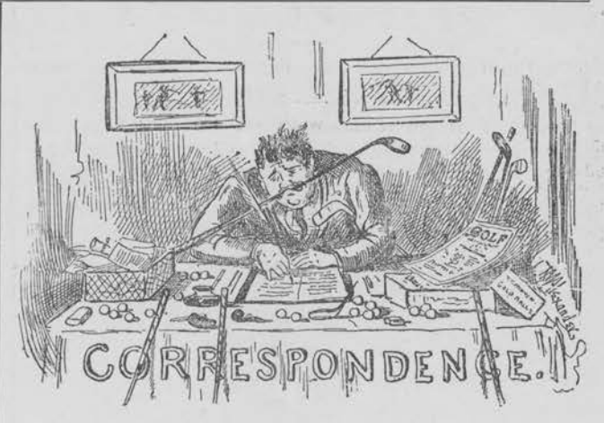
ST. ANDREWS AS A CHAMPIONSHIP COURSE.

ST. ANDREW'S.—IMPERIAL HOTEL, North Street, Murray Park, two minutes' walk from sea and Links. First-class Family and Boarding Hotel, moderate charges.—LAWRENCE & Son, Proprietors. Telephone 1102.