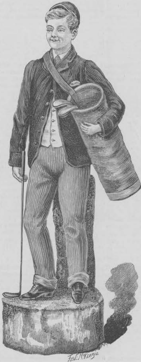
“THE GOLF CADDIE.”

ornaments to match, and a silver tea service, subscribed for by members of the club in recognition, on his retirement some short time ago from the office of hon. secretary, of his great services to the club, which practically owes its present popularity to his exertions during the years he held the secretaryship.