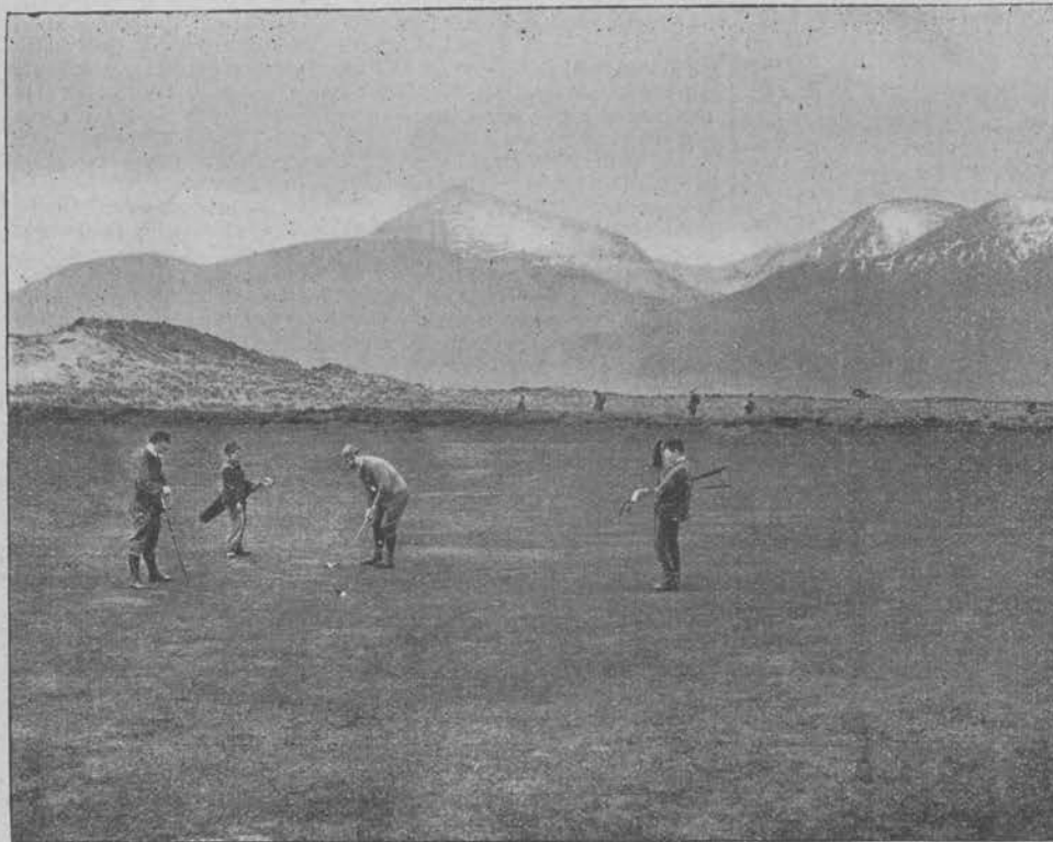
THE FIELD HOLE.

the longest putts on record. We are able to reproduce two or three photographs of the principal greens, and a view of the stupendous Matterhorn—a bunker which rises forty feet high on the line of the approach to the sixteenth hole. This green can be approached to the left by cautious players, but a stroke is lost by such a proceeding; the fearless and straight driver gets upon the green with his tee-shot. The green of the fourth hole, known as the "Priest's," is a splendid sample of a laid green. It lies at the foot of an enormous sand bunker, which has been the grave of many a wild approach. The "Field" hole is the fourteenth, where a magnificent expanse of turf favours the wooden putter, and from which a rare view is obtained of the grand chain of mountains under which Newcastle nestles—a