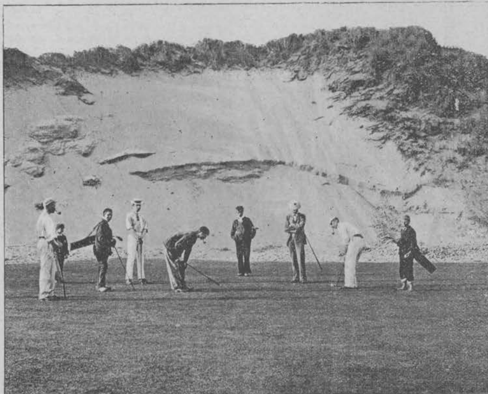
THE PRIEST'S GREEN.—"You've that for a half!"