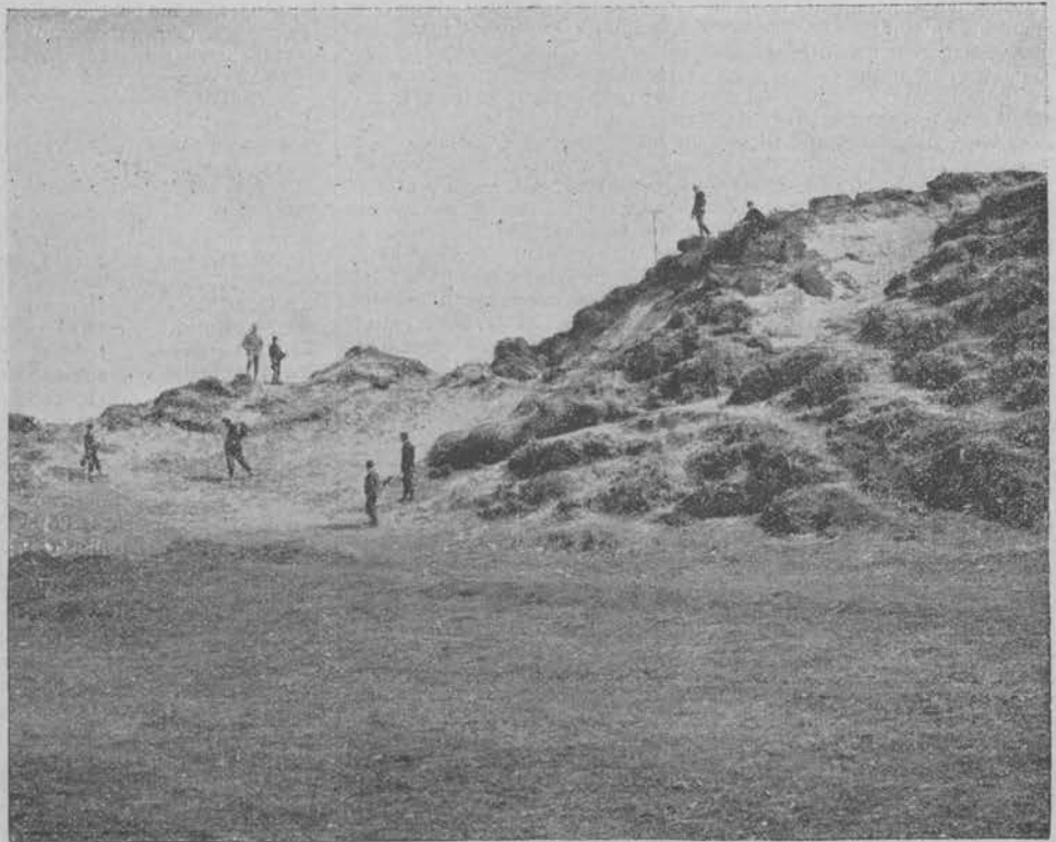
THE MATTERHORN.—In trouble and well over!