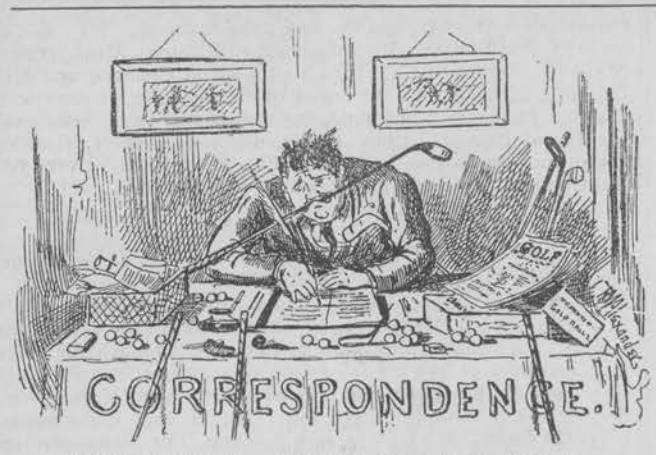
THE AMATEUR CHAMPIONSHIP FINAL.