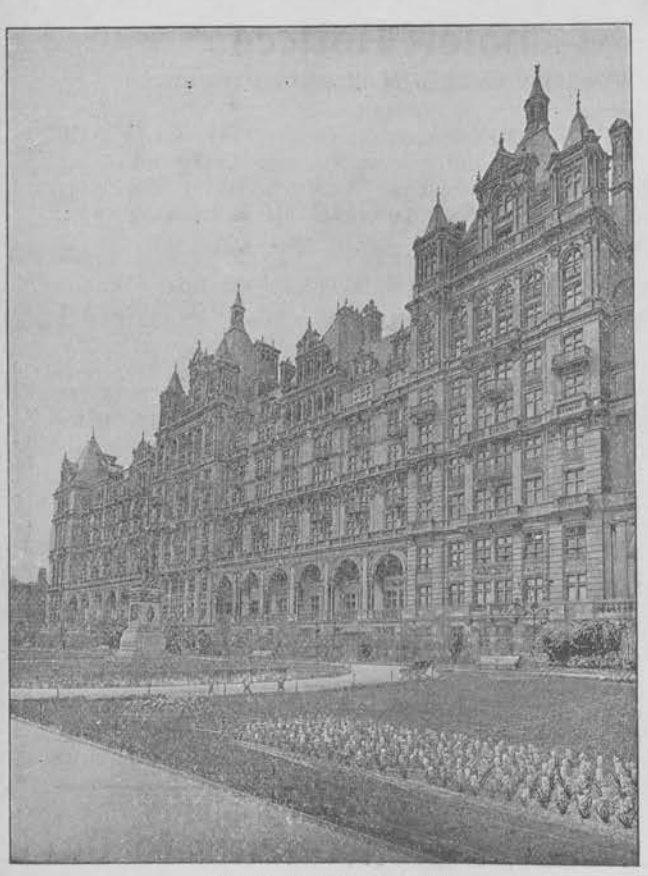
WHITEHALL COURT. View of Building facing River Thames. The Archways in Centre of Building represent Golfers' Club Premises.