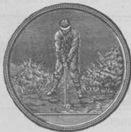
Medals, Badges, Cups, Shields. Monthly Medals. LISTS FREE.