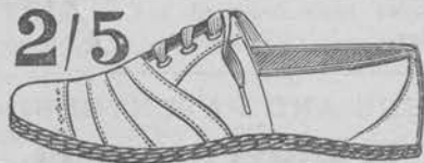
best materials ever made. Length of Walking Boot only required.

WHY BUY EXPENSIVE, UNCOMFORTABLE, OR TRASHY SHOES.