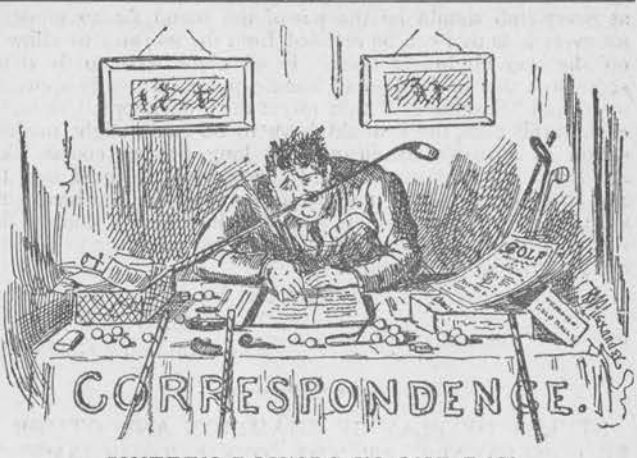
SIXTEEN ROUNDS IN ONE DAY.

FRY'S PURE CONCENTRATED COCOA.—"Remarkable for its absolute purity, its nutritive value, its pleasant taste, and its property of ready assimilation."—Health. 100 PRIZE MEDALS. Ask for FRY'S PURE CONCENTRATED COCOA,