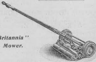
"The Britannia" Lawn Mower.

Shanks's Machines are the only Mowers fitted with Patent Axle Springs, which reduce vibration to a minimum, and effect remarkable ease in manipulation. See Lists of Testimonials relating to the Patent Axle Springs. Catalogues with Illustrations and Prices of Hand, Pony, and Horse Mowers and Rollers on Application.