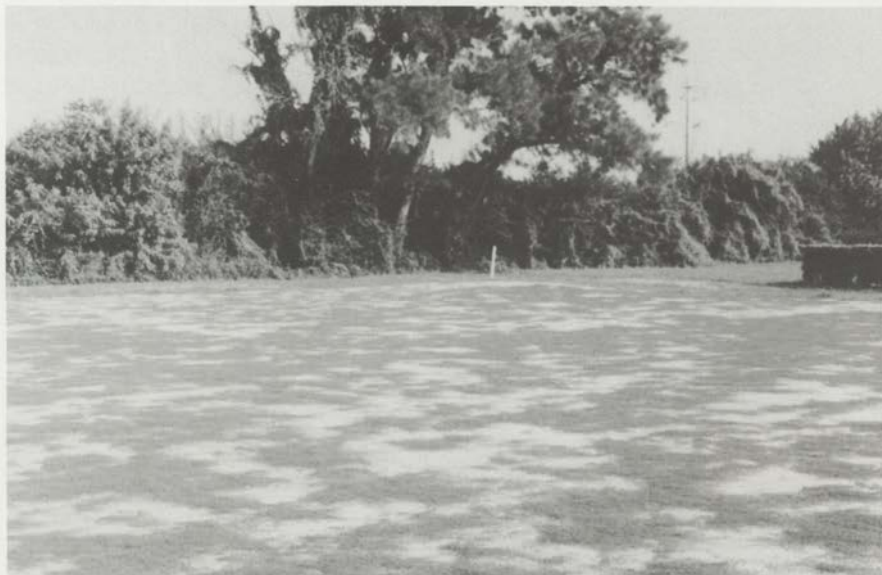
The FGCSA Research Green at Fort Lauderdale was mowed for the first time in September.

FLORIDA GREEN: Should the Florida Green enter the GCSAA Newsletter Contest now that it is professionally published? Eddie Snipes suggested that we should continue to submit our magazine to the contest but send a letter to Clay Lloyd suggesting a separate category for those that are professionally