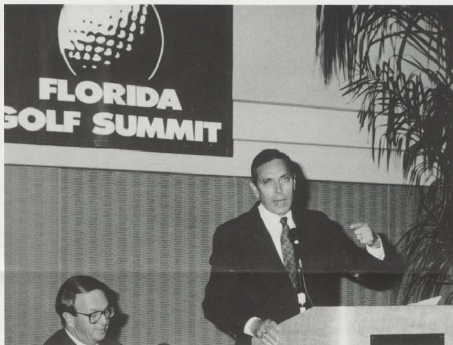
Gov. Bob Martinez and Arnold Palmer were two major speakers at Florida Golf Summit.