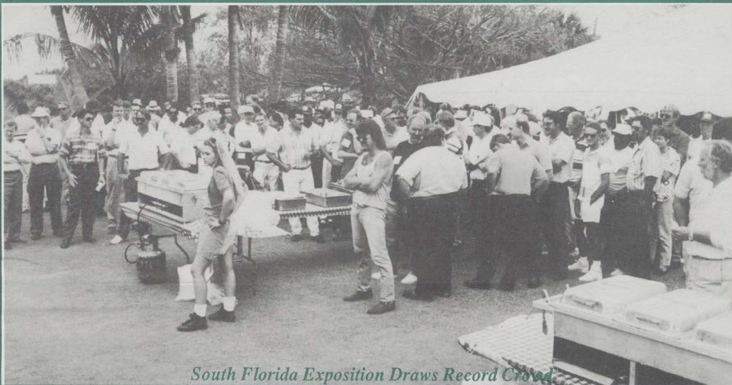
South Florida Exposition Draws Record Crowd

NEWSLETTER OF THE FLORIDA GOLF COURSE SUPERINTENDENTS ASSOCIATION