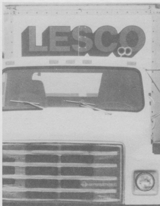
Yes, the big LESCO truck did arrive in time for the SF Exposition equipment demonstration