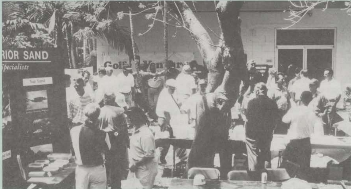
SFGCSA Hosts 9th Annual Exposition . See story on page 7.

NEWSLETTER OF THE FLORIDA GOLF COURSE SUPERINTENDENTS ASSOCIATION