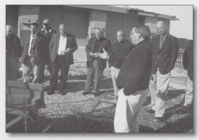
Sprayer calibration caught everybody's attention.