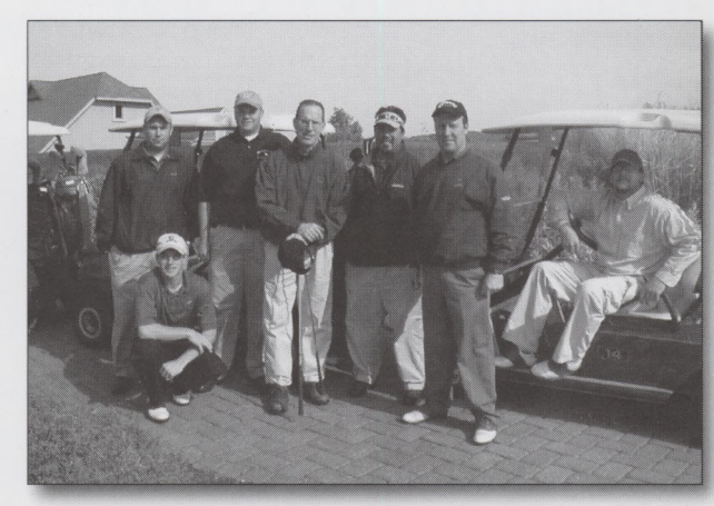
The Crystal Springs Golf Resort boys get ready to take on Ballyowen.