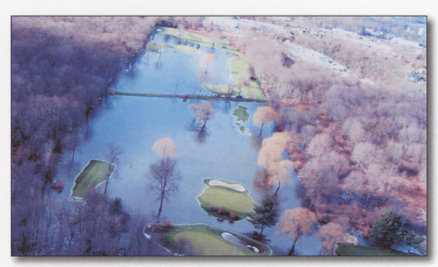
The editor took some chin music from Mother Nature numerous times in 2005.