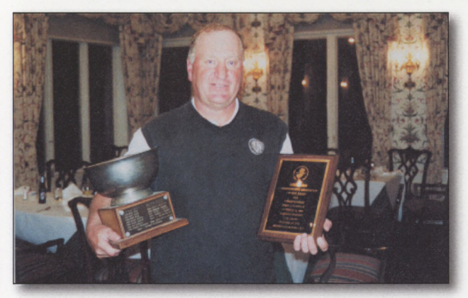
Bill Murray proudly holds golf's most coveted prize - The Sherwood Moore Cup.