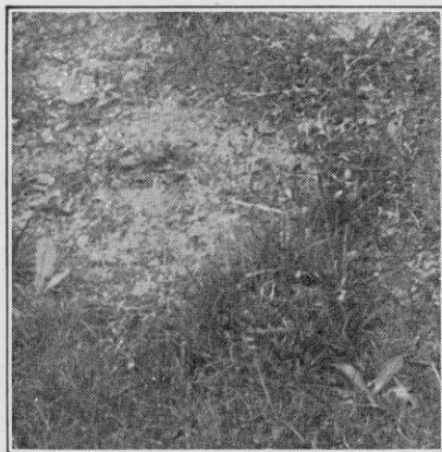
A thin, starving lawn where weeds have a free hand.

The real exhaustion of fertility results from the growth of the lawn itself. In just one growing season, a single grass plant may develop as much as 36 inches of growth in stems and leaves. Unless the food consumed in producing this bumper crop is replaced, starvation must soon set in—and this is the most common cause of lawn failures. Such failures are easily avoided by a simple program of lawn feeding. The nominal cost returns generous dividends in green, healthy, weedfree turf.