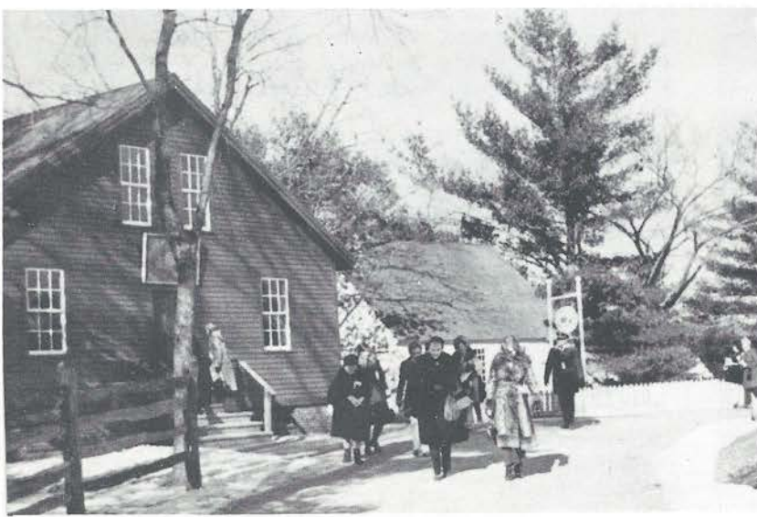
The Sturbridge Village tour for the ladies.