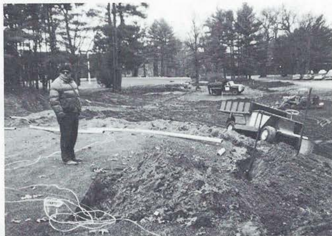
Who is that behind the Foster Grants???