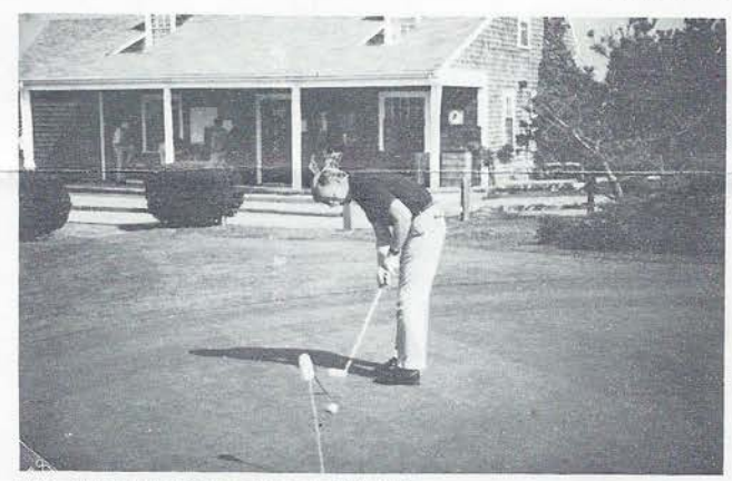
The Snowman lining up another 8