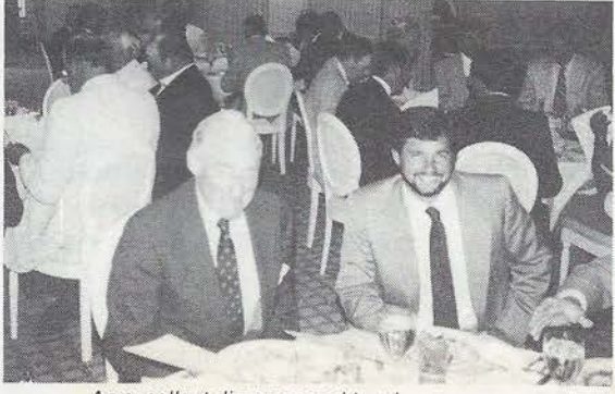
An excellent dinner served to a hungry group.