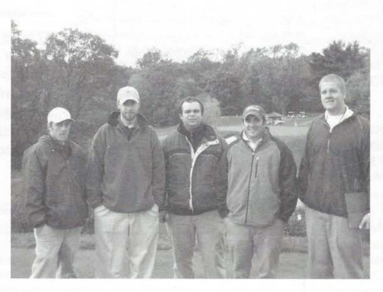
UMass Turf Club supports the Troll Fundraiser Tournament at Westchester Country Club

touring these facilities, members were able to gain insight as to how each operation is managed to create the best possible playing conditions. Also, volunteer projects have included tee construction at local golf course Cherry Hill and the renovation of Lorden Baseball Field on the UMass Campus.