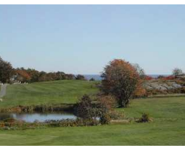
The gnarly coastal New England terrain of Bass Rocks

and par 69, and everybody I know just looks at the scorecard and says, 'Oh, that place is so short.' Then they come and play and it's not so short anymore. It's very challenging."