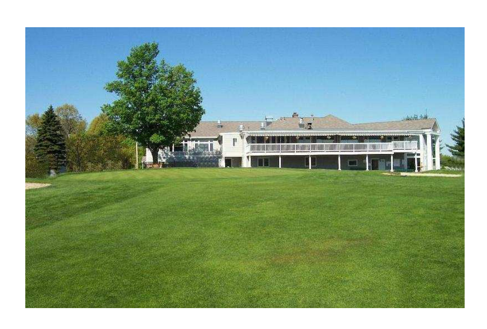
Ludlow Country Club's home hole and clubhouse

*We accept Visa, Mastercard and American Express